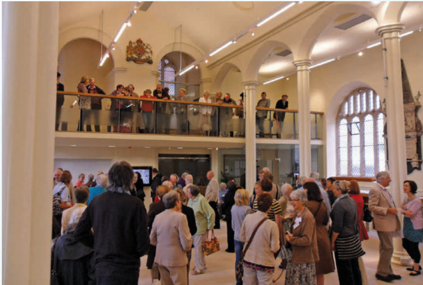
Thousands of pounds raised from donations from the general public