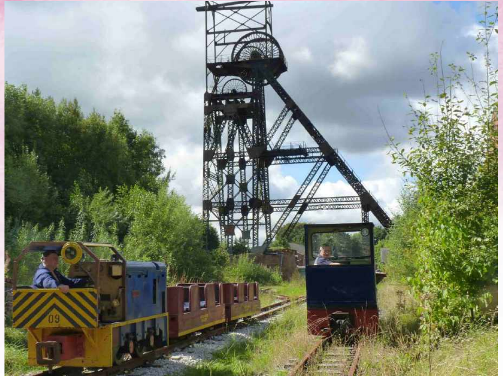
Lancashire's last colliery

Since construction, the museum attracts more visitors and has seen a rise in return visitors. This has enabled the society to realise another major project - making the steam winding engine operational. This is the largest of its type in the UK and has been scheduled by English Heritage. Work is now in progress on another project to preserve the 100ft high winding tower, which is also a scheduled monument.