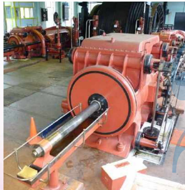
Largest steam winding engine in the UK