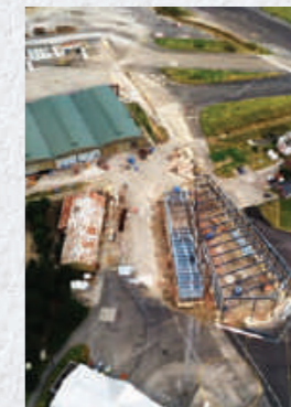
Bristol Aerospace Centre, new hangar and archives, due to complete in 2017