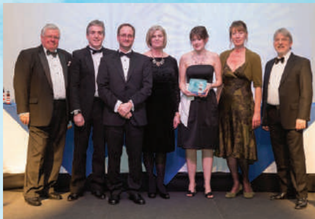
Winner of South West Tourism Excellence Award